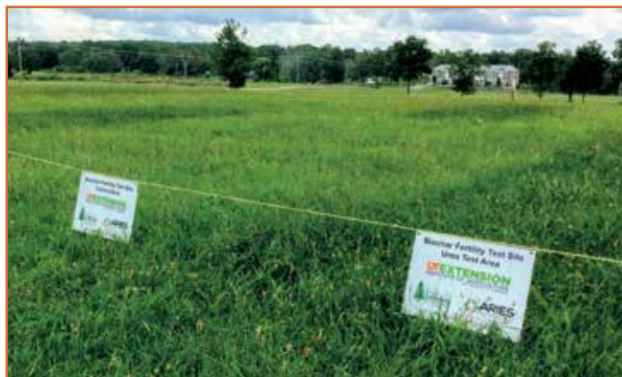
Signs mark the boundaries of the test site located in Wilson County, Tennessee