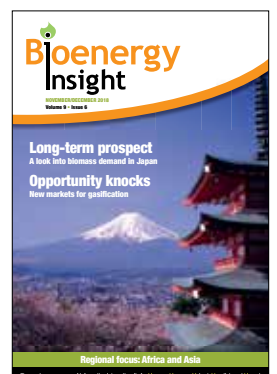
Front cover image courtesy of Bigstock. © German Cheung