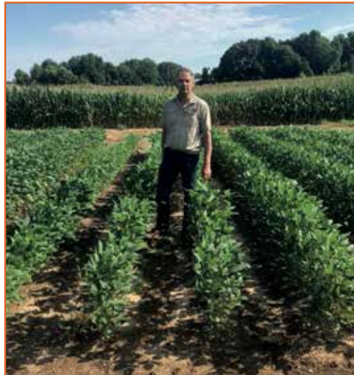
The frowning doctor poses with the untreated field to show the height and physical differences

Tall fescue is the most commonly used grass for beef cattle production in Tennessee and the southeastern USA. The effects of different rates of biochar applied to an established pasture on the growth of tall fescue is being investigated in Wilson County (where the Lebanon plant is located). Biochar from the gasification plant was weighed and spread by hand on the one-third-acre test area. The first fescue harvest and soil sampling took place