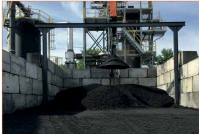
Biochar, the byproduct of biomass gasification, is collected for future soil amendment application at the Lebanon, Tennessee, plant.

The city engaged Aries Clean Energy as a first step toward being more independent with its waste disposal solution. Aries proposed a downdraft gasification plant that would use waste wood and biosolids from the wastewater treatment plant for its fuel, diverting wood waste and biosolids from the landfill. The plant would generate enough electricity behind